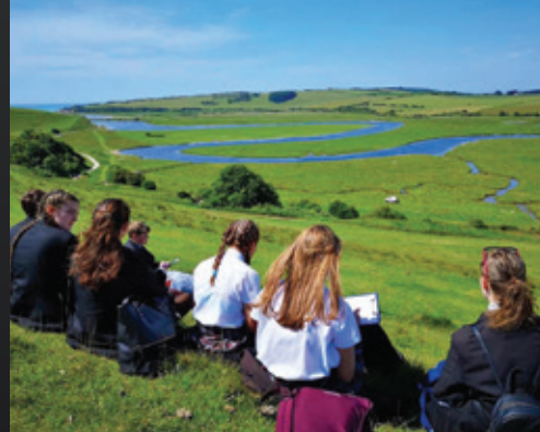
River Cuckmere Geography Trip